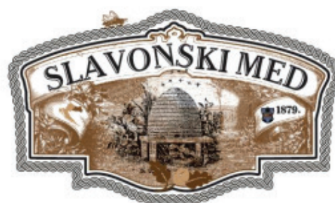
Figure 1 „Slavonski med“ label (Ministry of Agriculture, 2023)

In the Official Journal of the European Union, L 17 of January 23, 2018, the following was published: Commission Implementing Regulation (EU) 2018/95 of January 9, 2018 on the entry of names into the register of protected designations of origin and protected geographical indications (“Slavonski med” - PDO). “Slavonski med” is distinguished by its freshness (HMF value max. 16.5 mg/kg) and with a water content of up to a maximum of 18.3%. “Slavonski med” has a pollen spectrum or the presence of plant species in “secondary pollen” from the families Brassicaceae , Rosaceae and Robinia spp. in most single-flowered and multi-flowered honeys, which is how it differs from honey produced in other areas. The characteristics of “Slavonski med” are reflected in its physical, chemical, melissopalynological and organoleptic properties. “Slavonski med” is not subjected to intensive heat treatment. It can be decrystallized at a maximum temperature of 43 °C, which ensures that its properties derive from the specific flora on the defined area and thanks to the bees remain unchanged. Similarly, “Slavonski med” is jurs from the frame without heating, by the centrifuge process, must not be pasteurized in order to preserve the specified properties (Ministry of Agriculture, 2023). Each package placed on the market must be marked with the logo shown on Figure 1.